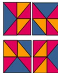
Alternate Four Block Option