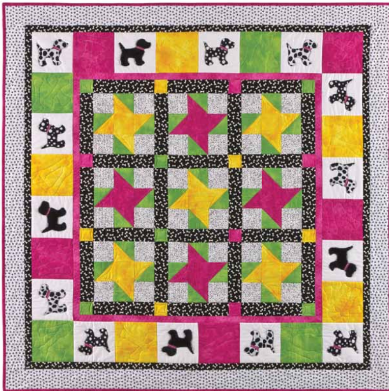
Fabric provided by Timeless Treasures and Shannon Fabrics, Inc.