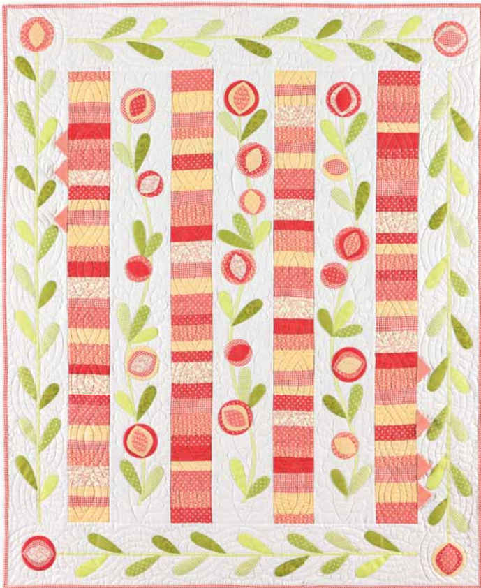
Fabric provided by Moda Fabrics, Strawberry Fields