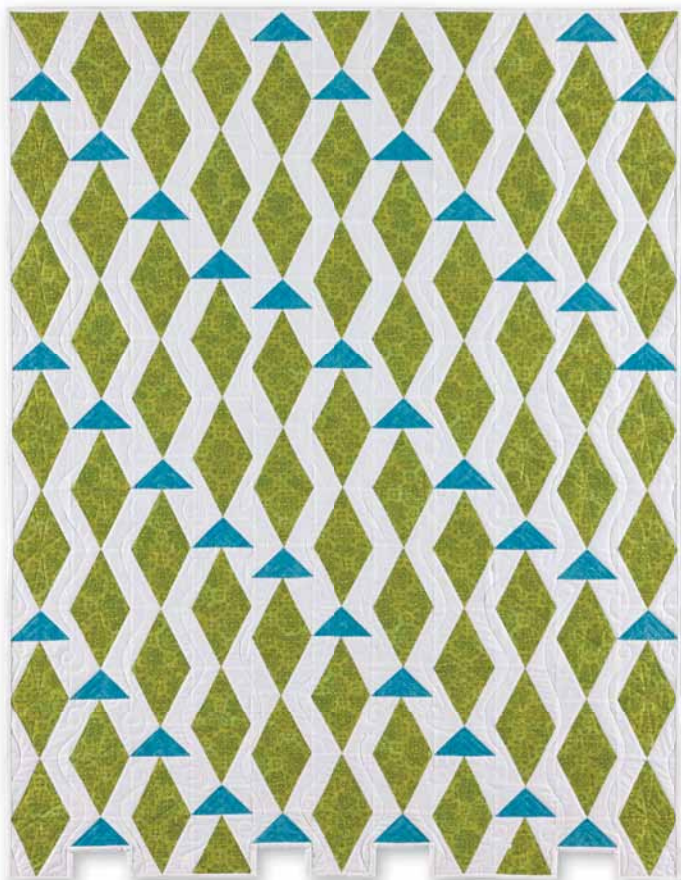
Fabric provided by P&B Textiles.