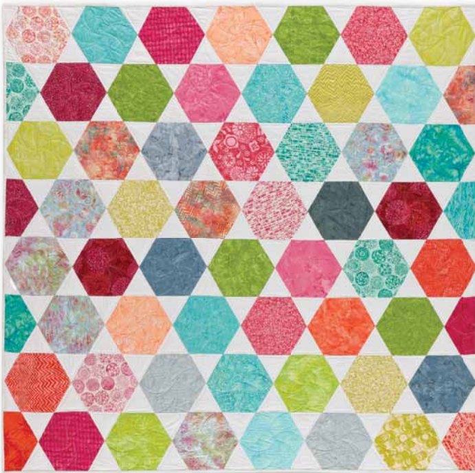
Fabric provided by Hoffman Fabrics.