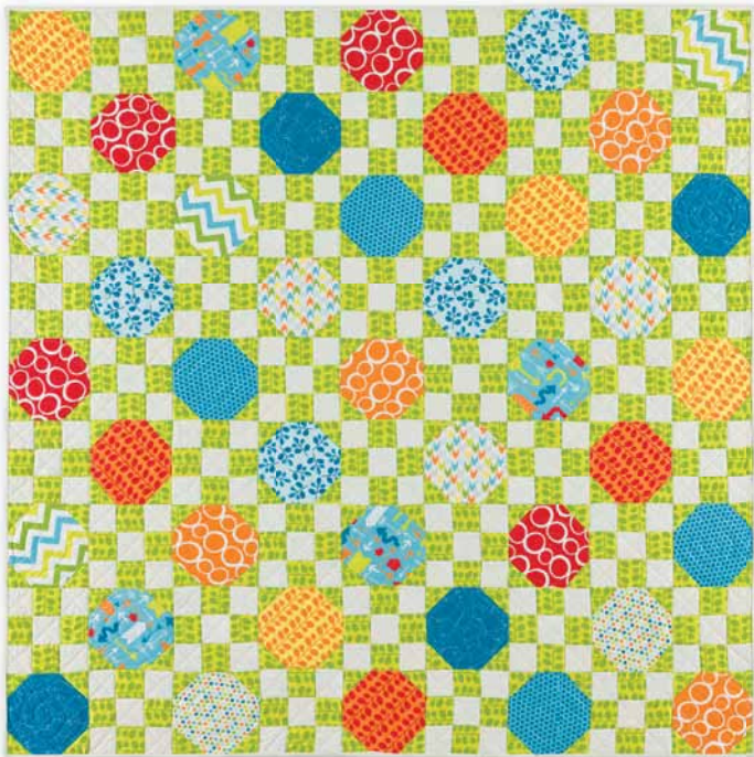
Fabric provided by Moda Fabrics.