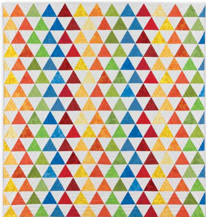
Fabric provided by Wilmington Prints.