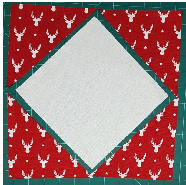
Figure 3 Layout for the Square in a Square block