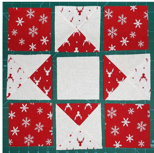
Figure 2 Layout for the Ohio Star block