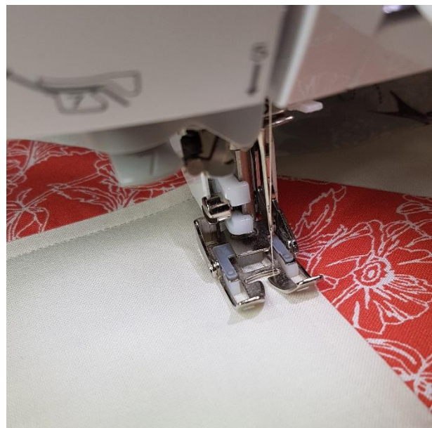
Figure 4 Quilting 1/4 inch away from the seam with a walking foot.