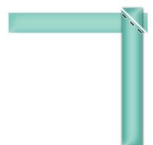
Figure 5 Sew the strips together at right angles and then trim off the excess.