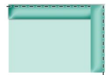
Figure 7 Fold the strip back on itself.

Continue sewing down the side of the quilt and repeat for each corner. Slot the end of the binding inside the folded end to neaten.