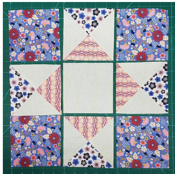
Figure 2 Layout for the Ohio Star block