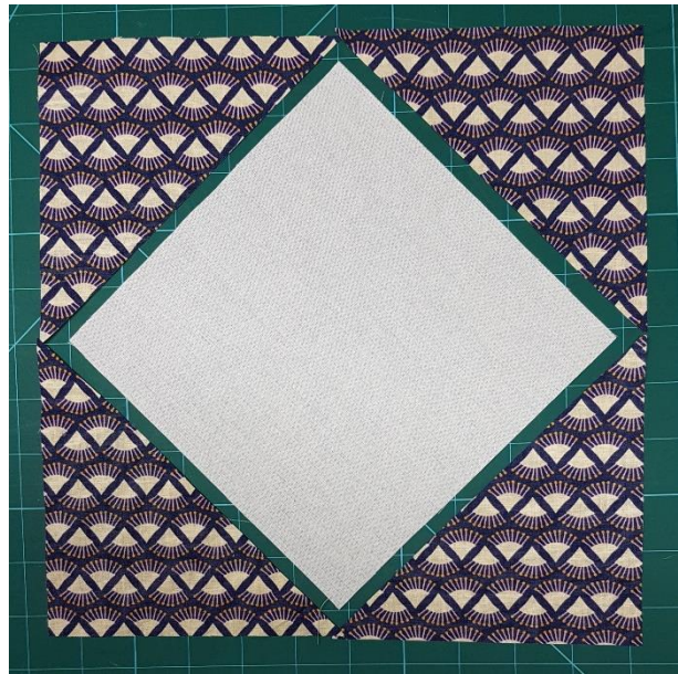
Figure 3 Layout for the Square in a Square block