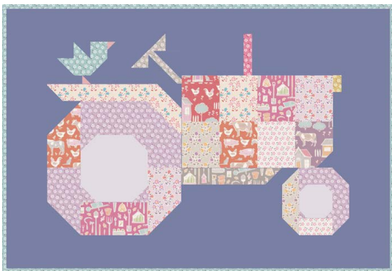
Patch Tractor Pillow Lupine

This pillow has been designed as a companion to the Patch Tractor Quilt and uses a solid lupine colour for the background. The block is framed by a simple border. There is also a version of the pillow that uses a terracotta background, which has a different position for the little bird, and so has its own instructions.