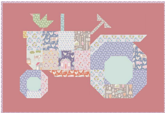
Patch Tractor Pillow Terracotta (next page)